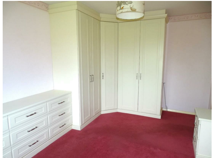
FITTED WARDROBES AND DRAWER UNITS