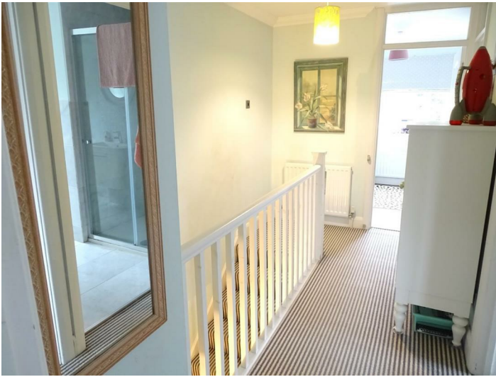
Access to roof space, radiator, swan neck coving.