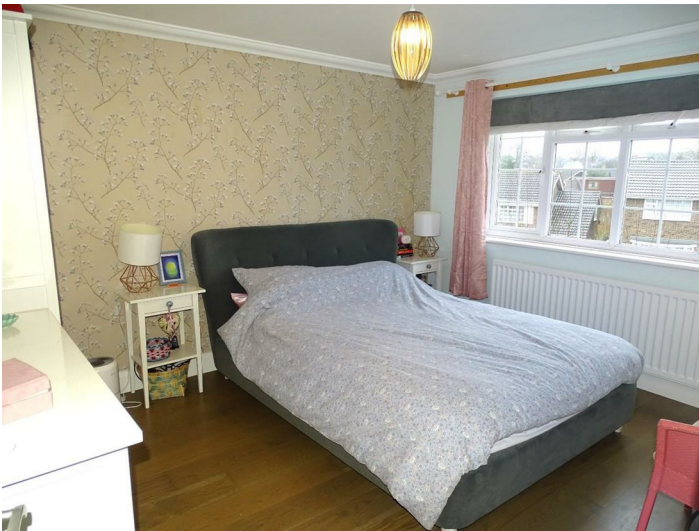
Radiator, laminate flooring, swan neck coving, upvc double glazed window to front.