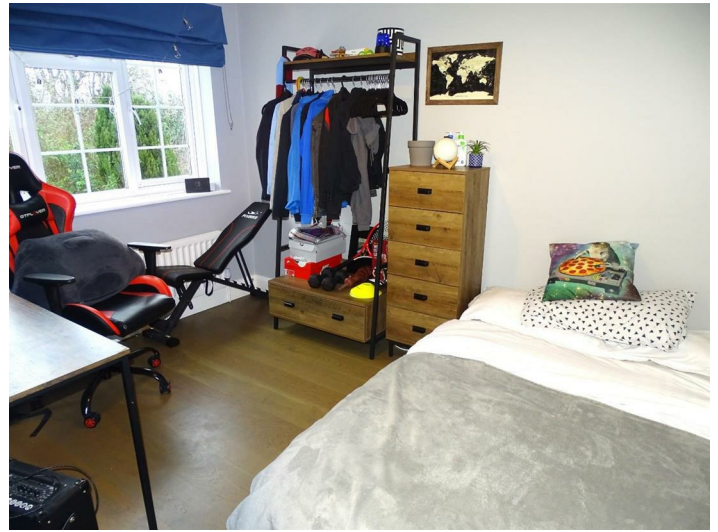
Radiator, laminate flooring, swan neck coving, upvc double glazed window to rear.