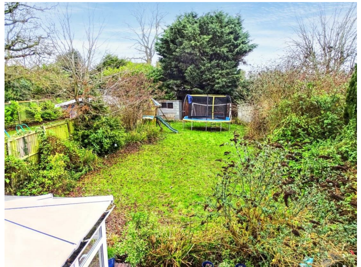
VIEW TO REAR GARDEN