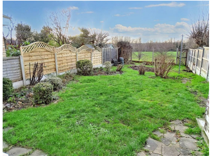
Laid to lawn with a variety of shrubs and fenced boundaries. The garden backs on to a sports ground.